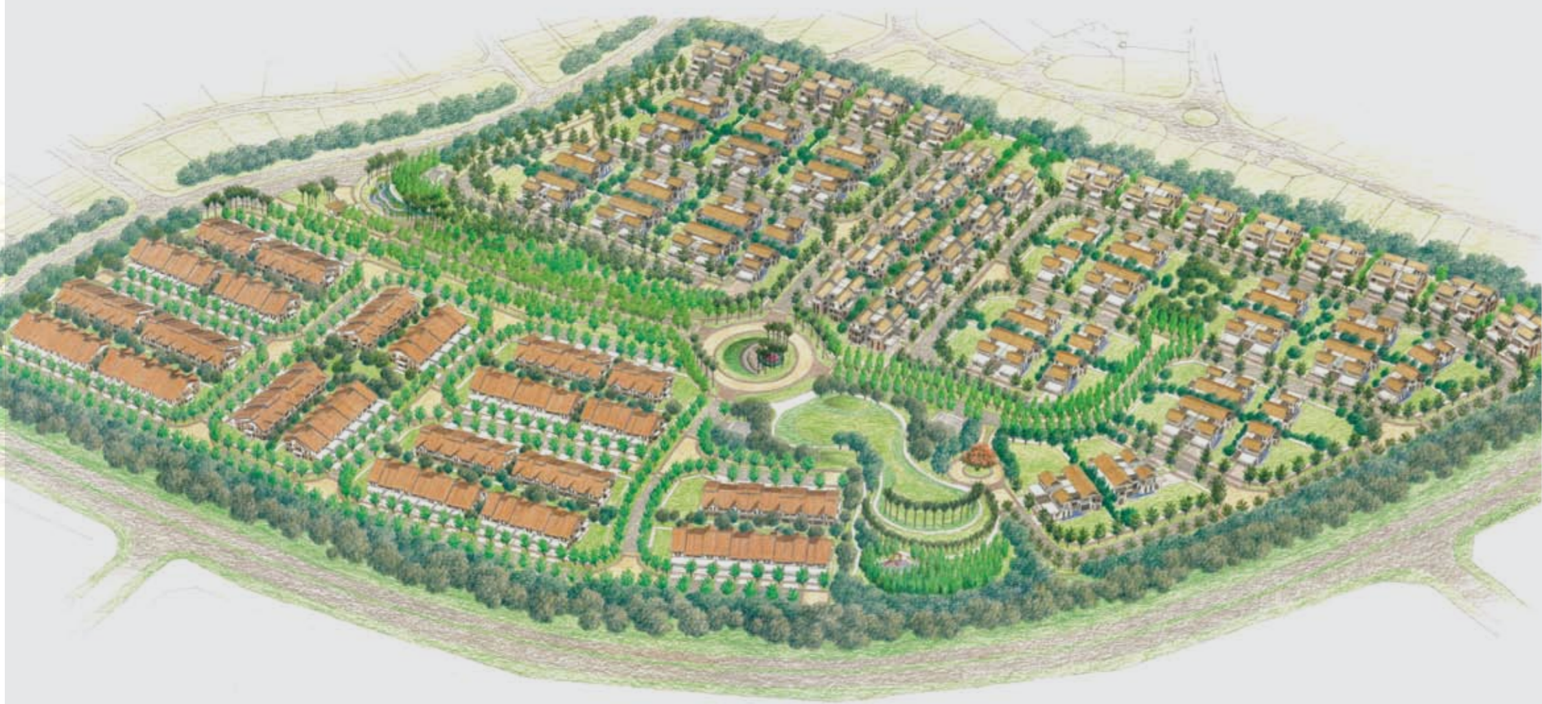
Overall landscape view for phase 8A5